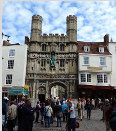
Christ Church Gate seen from Mercery Lane