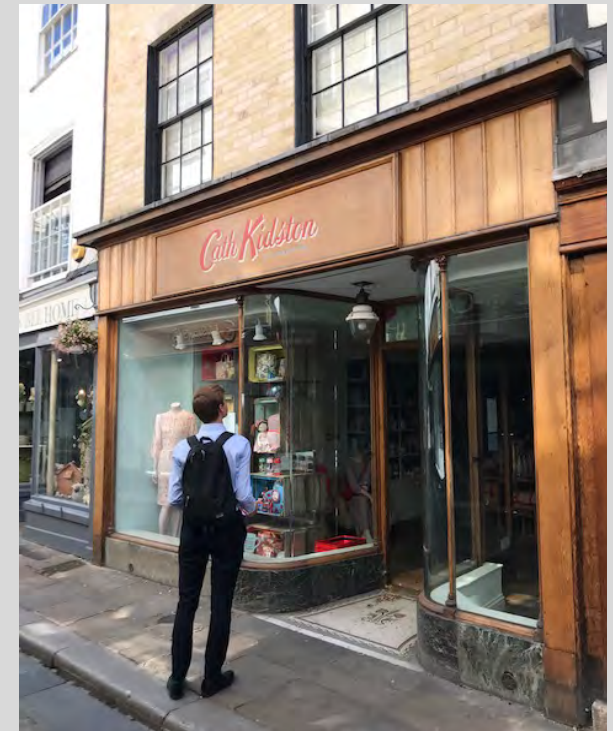
Mercery Lane Entrance